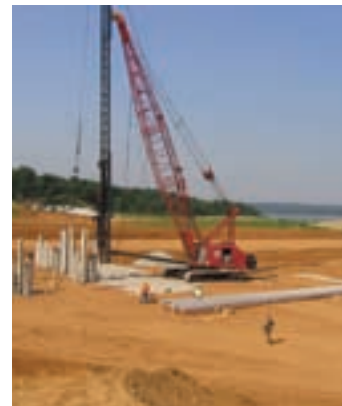
On the Cover: Weeks Marine, Inc.