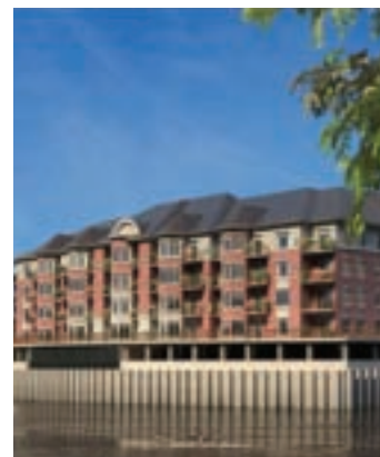
On the Cover: The National Harbor Project.