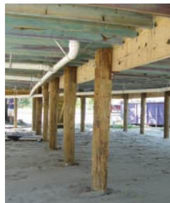
On the cover: Coeur D'Alene