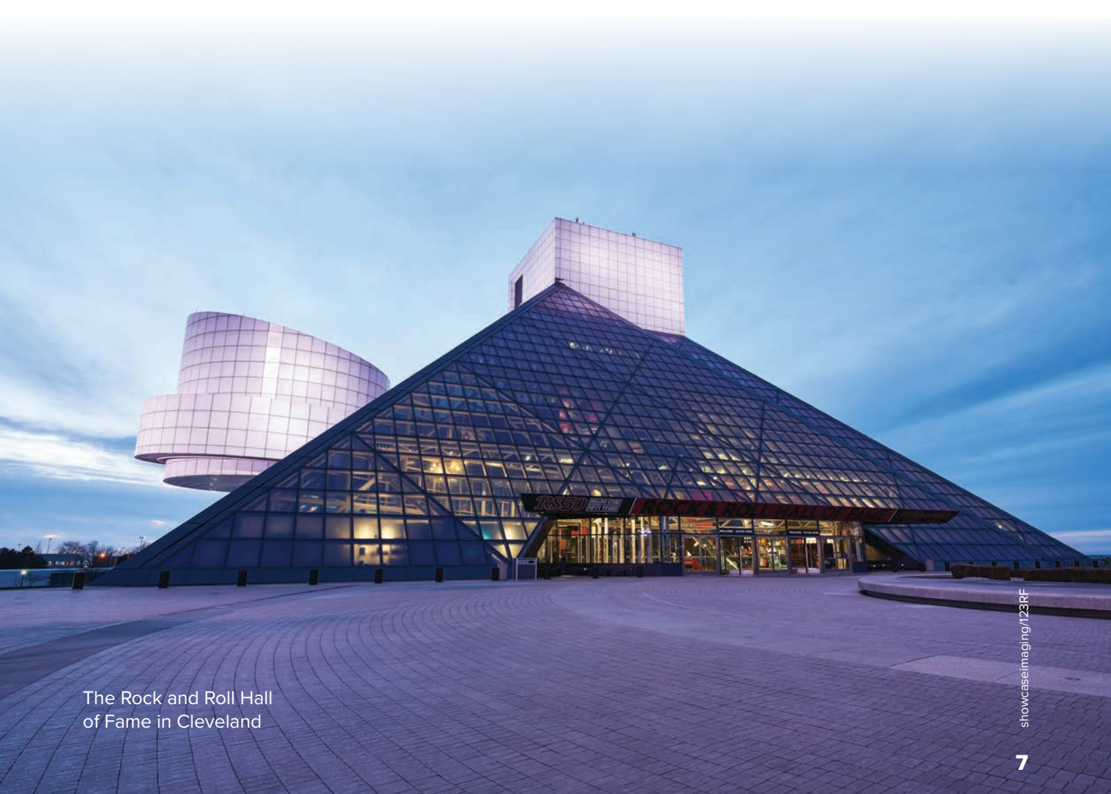
The Rock and Roll Hall of Fame in Cleveland