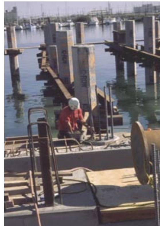
Wharf Construction - Structural fuse can be seen in foreground.

Batter piles can provide driven pile foundations a significant advantage over drilled piers and other vertical elements for deep foundations subject to lateral loads. Batter piles are particularly advantageous when there is a large unsupported