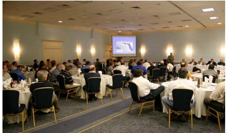
Florida Chapter Inaugural Dinner Attracts 105 Attendees